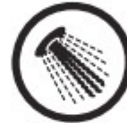
Inner Jet & Outer Rain