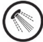
Inner & Outer Rain