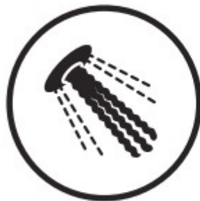
Outer Rain & Inner Jet