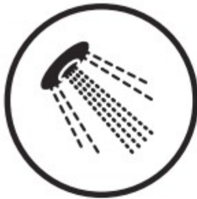
Inner & Outer Rain