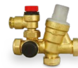
COLD WATER INLET SET