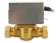
TWO PORT ZONE VALVE